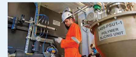
World's largest Enhanced Oil Recovery (EOR) polymer flood project