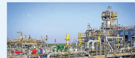
World's largest ASP