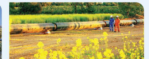
World's longest heated and insulated oil pipeline