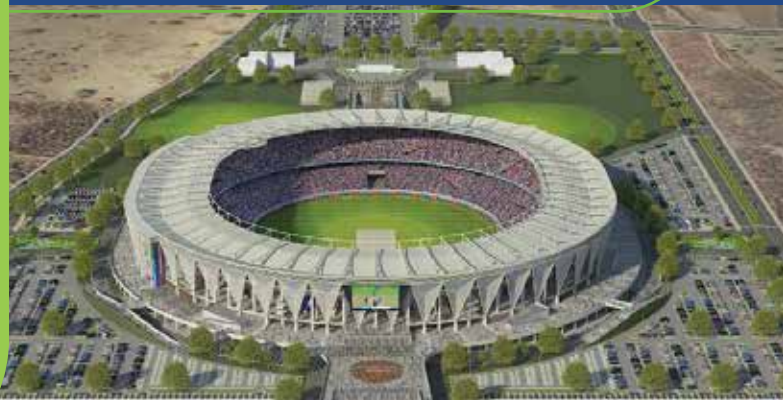
Anil Agarwal International Stadium - an artistic representation

Fostering progress through holistic development of communities